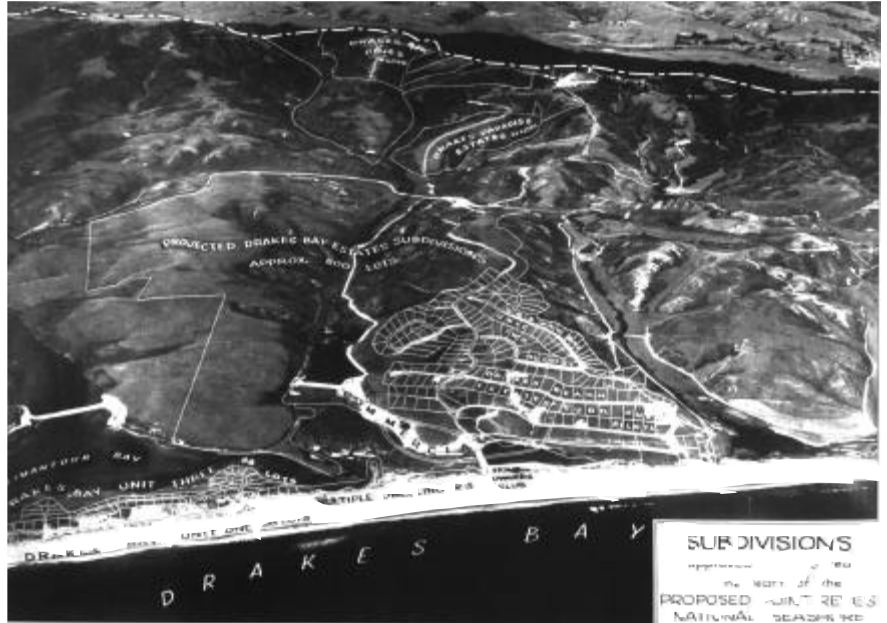
National Park Service Graphic

Point Reyes National Seashore in West Marin, only one hour from San Francisco, is a stunning environment. The headlands of Point Reyes, often windswept and shrouded in fog, is the site of the lighthouse illuminating the foggiest stretch of coastline in the Western U.S. On a sunny day the view to the south encompasses the sandy beaches of Drakes Bay and the cliffs of the