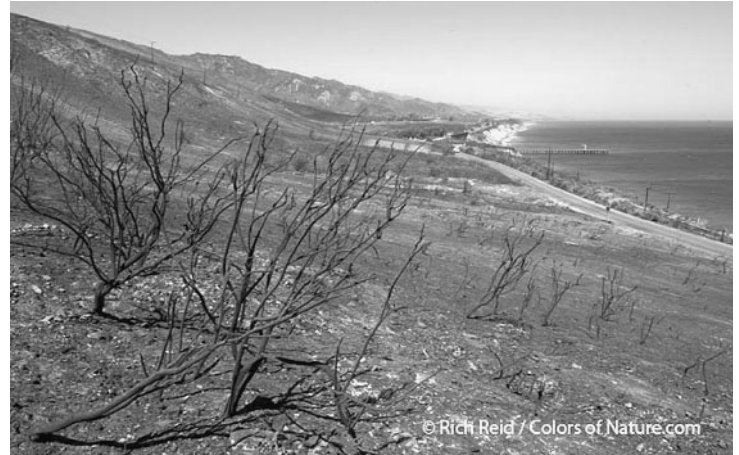
The charred Gaviota Coast looking east from Hollister Ranch.

Sometimes change is a good thing; even if we don't recognize it at first. Biologists tell us that living systems are dynamic; changing through time to such an extent that change is to be expected, even necessary. Natural forces, like fire and storms, routinely bring change. I think that's a good way to think about fire; a natural force of change. It is, in